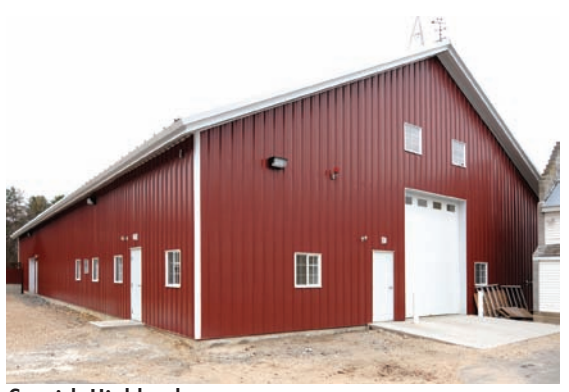
Scottish Highlands Salem, New Hampshire Construx, Inc., Builder