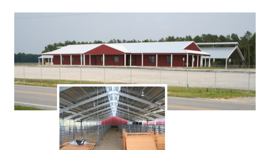
East Carolina Agriculture and Education Center Rocky Mount, North Carolina Danco Builders, Inc., Builder

Location: Harlan, Iowa Builder: Landmark Builders