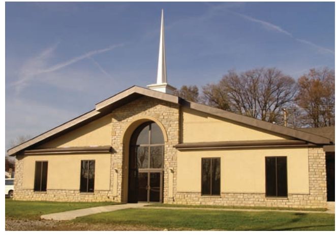
Galilee Missionary Baptist Church Columbus, Ohio Maverick Builders, Inc., Builder