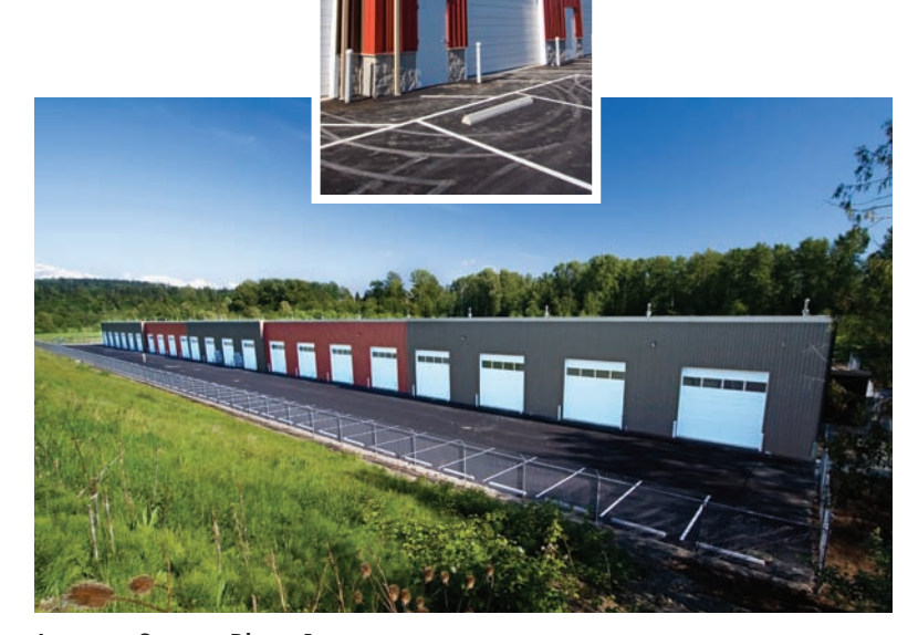
Irongate Storage Phase 1 Bellingham, Washington Faber Brothers Construction Corp., Builder