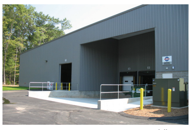
Hodell-Natco Westfield, Massachusetts Forish Construction Company, Inc., Builder