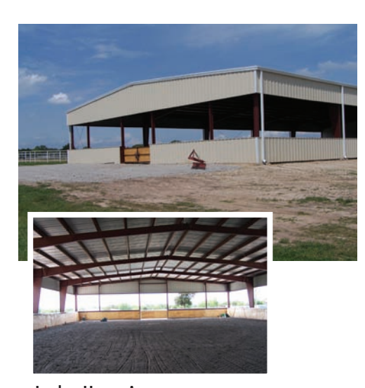
Leslee Hawn Arena Caddo Mills, Texas Rafter P Construction, Inc., Builder