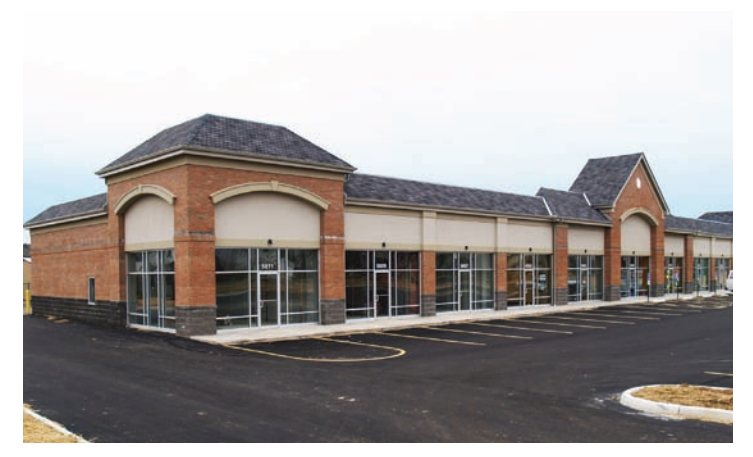
Chatterton Square Columbus, Ohio Maverick Builders, Inc., Builder