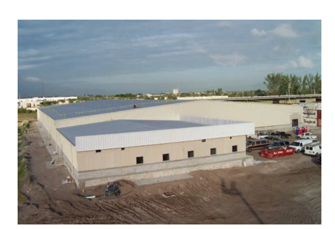
Tropical Shipping Riviera Beach, Florida Commercial Metal Building Services Corp., Builder