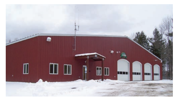
Plainfield Public Safety Complex Plainfield, Massachusetts Forish Construction Company, Inc., Builder