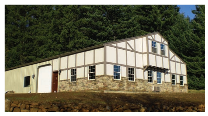
D & L Custom Restoration Salem, Oregon Landmark Pacific, Inc., Builder