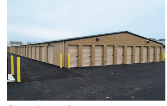
Chatterton Storage Facility Columbus, Ohio Maverick Builders, Inc., Builder

Project: Highlands Storage Village Location: Highlands, North Carolina Builder: R. L. Wright Construction