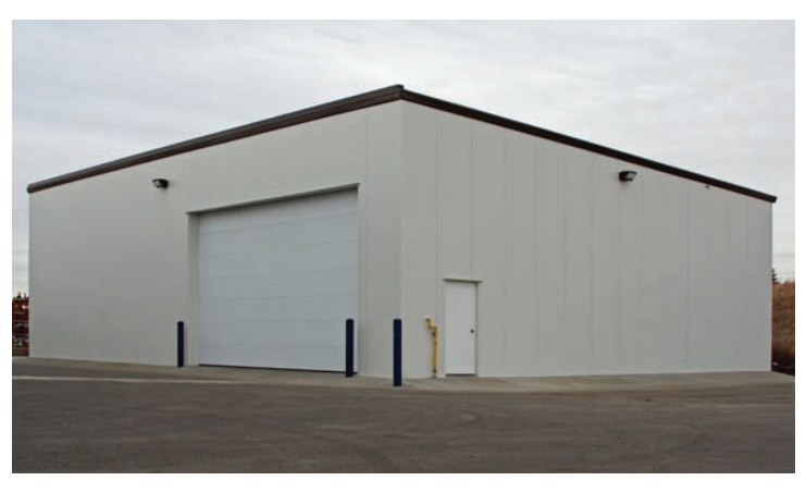
Edmonton Valve and Fitting Warehouse Edmonton, Alberta, Canada Carbon Steel Buildings, Builder