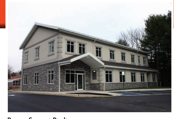
Remax Sunvest Realty Wilmington, Delaware Nowland Associates, Inc., Builder

Builder: Tittle Construction Company, Inc.