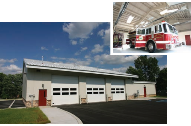
Glasgow Fire Station #10 Newark, Delaware Nowland Associates, Inc., Builder