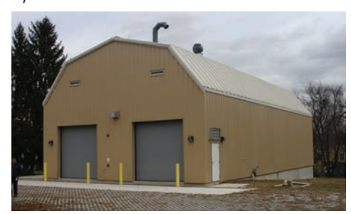
New Jersey American Water Company Edgewater Township, New Jersey Modern Technology, Inc., Builder