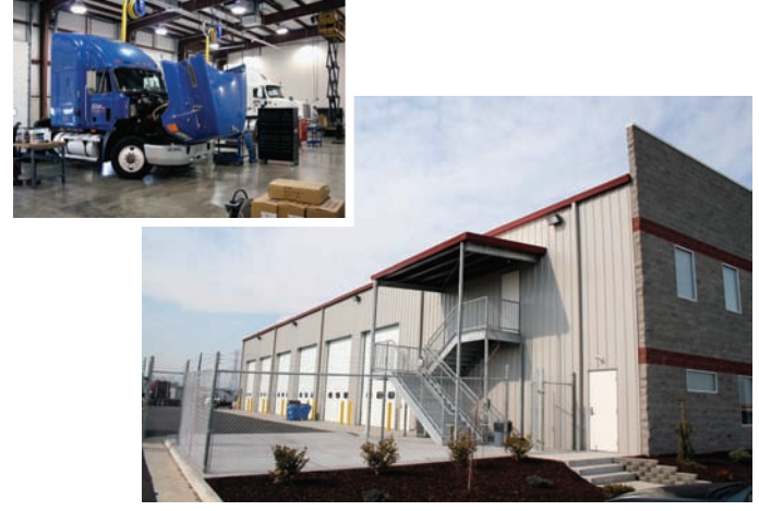
Beam Brothers Trucking, Inc. Mount Crawford, Virginia Lantz Construction Company, Builder