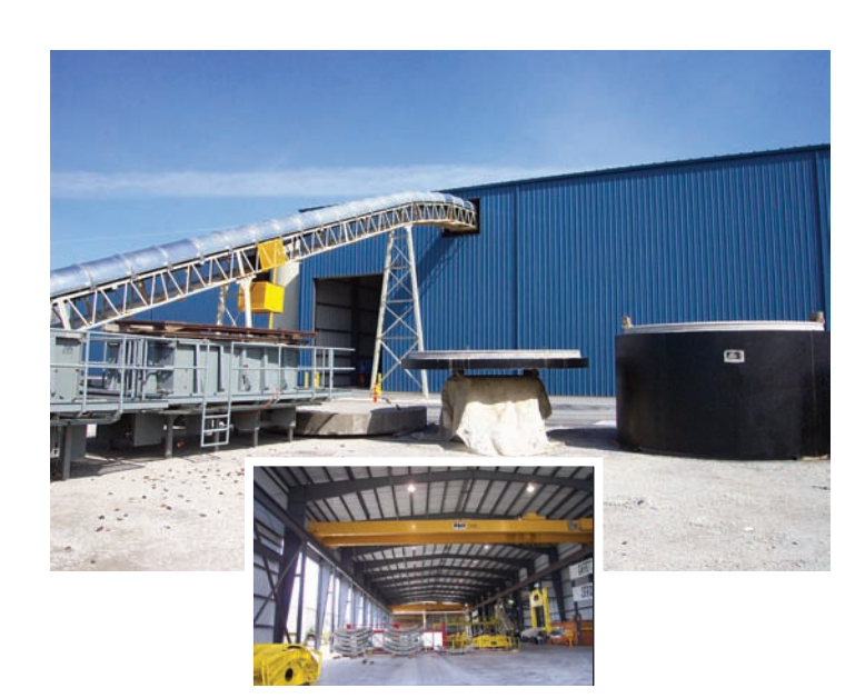
Concrete Pipe Manufacturing Tacoma, Washington Building Systems West, LLC, Builder