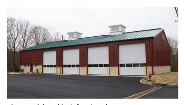
Bloomingdale Public Safety Complex Bloomingdale, New Jersey Atlantech Reps, Inc., Builder