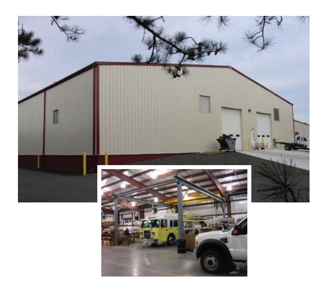
PL Custom Emergency Vehicles Manasquan, New Jersey Modern Technology, Inc., Builder