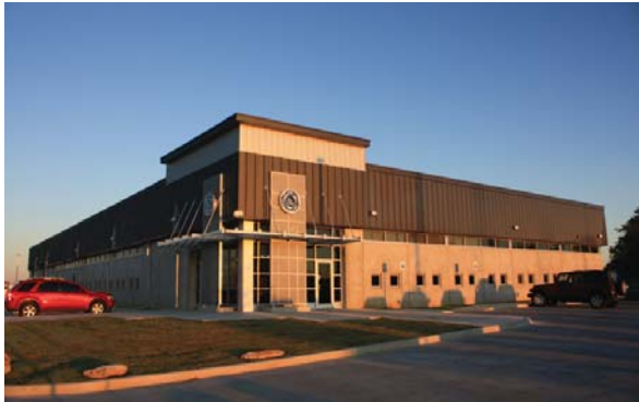
The Ross Group Construction Corporation Headquarters Tulsa, Oklahoma Pentacon, LLC, Builder