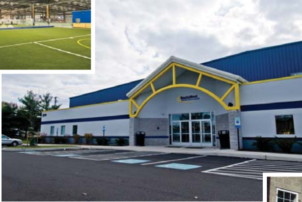
Bucksmont Indoor Sports Hatfield, Pennsylvania Schlosser Steel Building, Inc., Builder