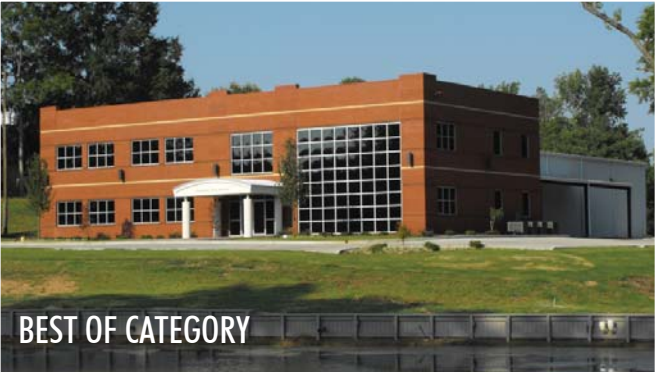
Project: Southeast Construction Office Location: Clanton, Alabama Builder: Southeast Construction, LLC