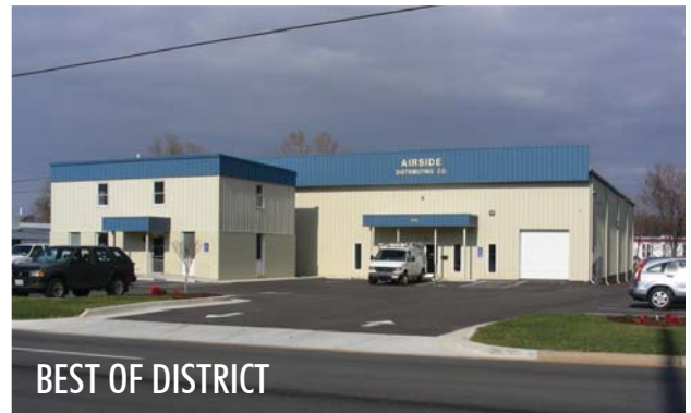
Project: Airside Distributing Company Location: Danville, Virginia Builder: Hughes & Atkins Construction Co., Inc.