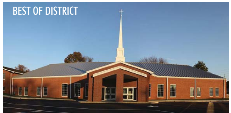
Project: Oakhill Baptist Church Location: Evansville, Indiana Builder: Wink Construction, Inc.