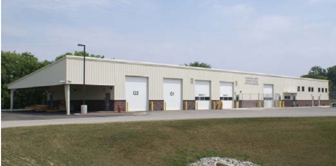
Hamilton County Community Corrections Noblesville, Indiana MacDougall Pierce Construction, Inc., Builder