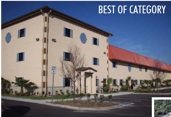
BEST OF CATEGORY

Project: Hull Pointe Business Park Location: Ormond Beach, Florida Builder: BETNR Construction Corp., Inc.