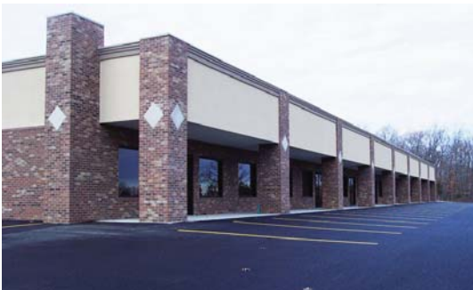
Tour Parc Plaza Leadington, Missouri Sargent Construction Company, Builder