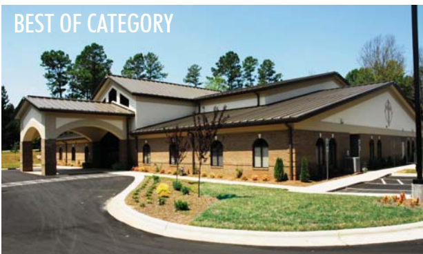
Project: Faith Harvest Church Location: Durham, North Carolina Builder: Danco Builders, Inc.