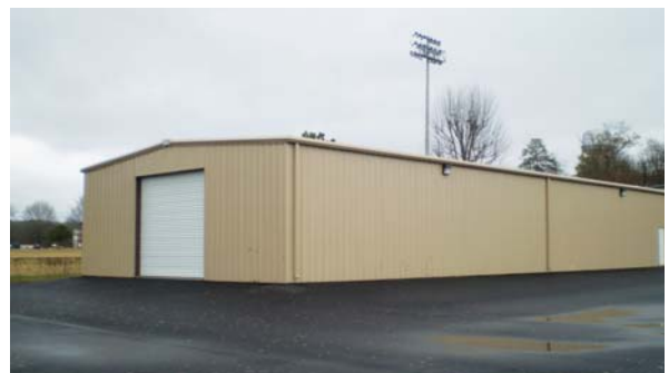
Traffic Safety Center Montevallo, Alabama Wayne Davis Construction, Builder