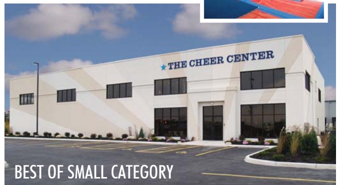
BEST OF SMALL CATEGORY

Project: Stoughton Wellness & Athletic Center Location: Stoughton, Wisconsin Builder: KSW Construction Corporation