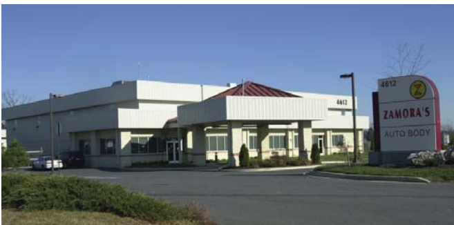
Zamora's Auto Body Frederick, Maryland Ballard Development Corp., Builder