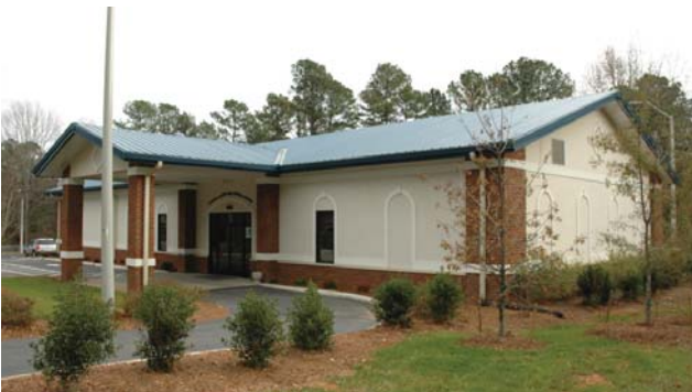
Garner Civitan Club Garner, North Carolina Dalton General Contractors, LLC, Builder