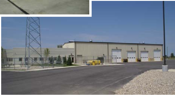
Center Grove Transportation Greenwood, Indiana MacDougall Pierce Construction, Inc., Builder