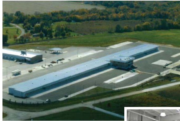
Con-Way LaSalle XLA LaSalle, Illinois Altra Builders, Inc., Builder