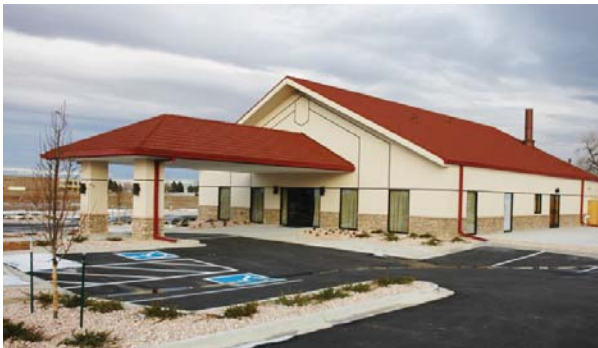
Highline Circle of Life Church Thorton, Colorado Calahan Construction Services, Builder