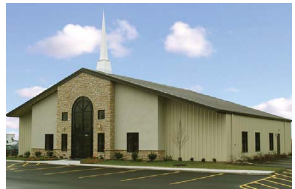
Templo Cristiano Emanuel Church Columbus, Ohio Maverick Builders, Inc., Builder