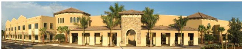
Project: Gold Coast Eagle Distributing Location: Sarasota, Florida Builder: Halfacre Construction Company