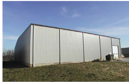
DeJong Manufacturing North Addition Sharon, Iowa Bushong Construction Company, Inc., Builder