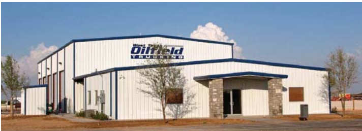
Oilfield Trucking Odessa, Texas Building Systems, Inc., Builder