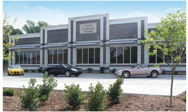
Curry Collision Center Bloomington, Indiana Building Associates, Inc., Builder