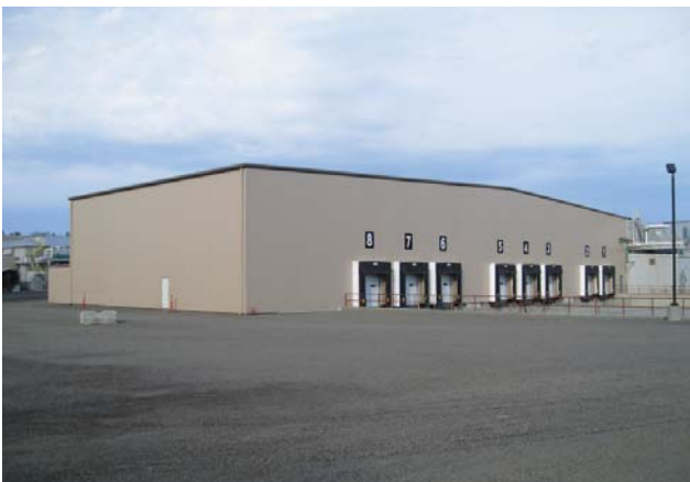
Allan Brothers Refrigerated Shipping Naches, Washington Concord Construction, Inc., Builder

Project: Hardware Sales Location: Ferndale, Washington Builder: Faber Brothers Construction Corp.