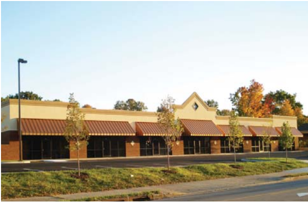
Oakland Square Johnson City, Tennessee Tittle Construction Co., Inc., Builder