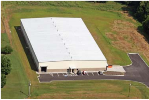
Electro-Mavin Riceville, Tennessee Wilson Construction Group, Builder