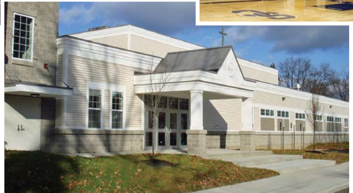
Schenectady Christian School Gym Scotia, New York United Progress, Inc., Builder