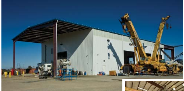
Shimmick Mechanical Shop Tracy, California TMW & Associates, Inc., Builder