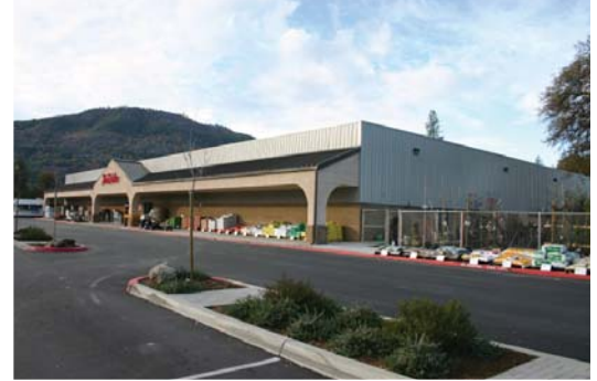
True Value Hardware Oakhurst, California Richard Hedman, Inc., Builder