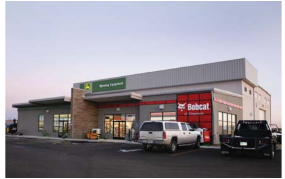
Wyoming Equipment Cheyenne, Wyoming Century Commercial Builders Corp., Builder

Project: The Hangout Location: Gulf Shores, Alabama Builder: M & B Construction, LLC