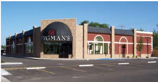
Bergman's Lubbock, Texas LHG, Inc. General Contractors, Builder