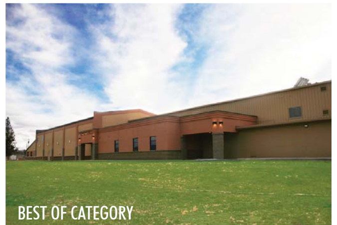
BEST OF CATEGORY

American Commercial College Odessa, Texas Building Systems, Inc., Builder