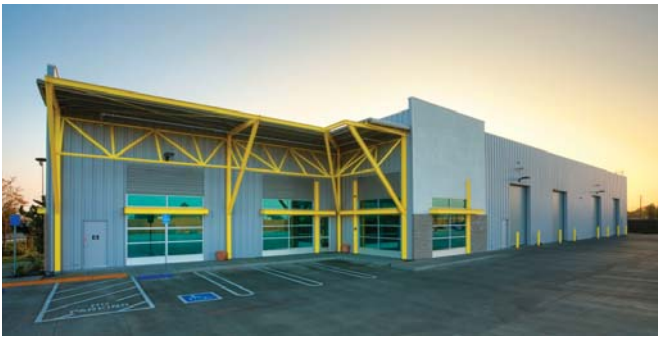
Delta Fence Brentwood, California TMW & Associates, Inc., Builder