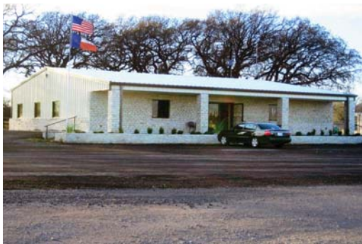
United Texas Drilling Weatherford, Texas G-Force & Associates, Inc., Builder