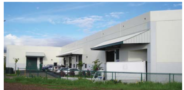
Bel Air Distributors Waipahu, Hawaii SteelTech, Inc., Builder