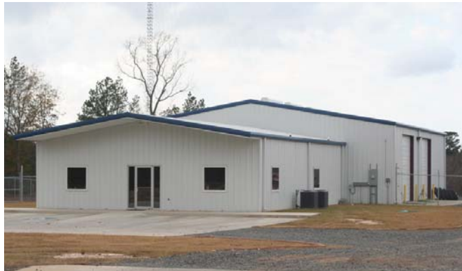
Nichols Transport Kilgore, Texas Hendrix & Arp Contracting Services, LLC, Builder