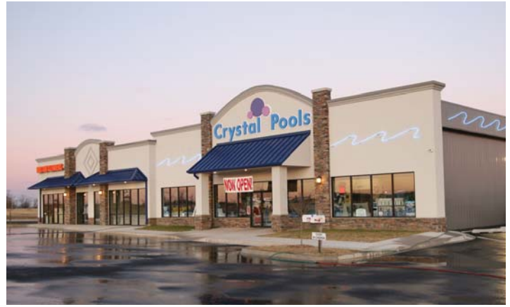
Crystal Pools Glenpool, Oklahoma Stava Building Corporation, Builder