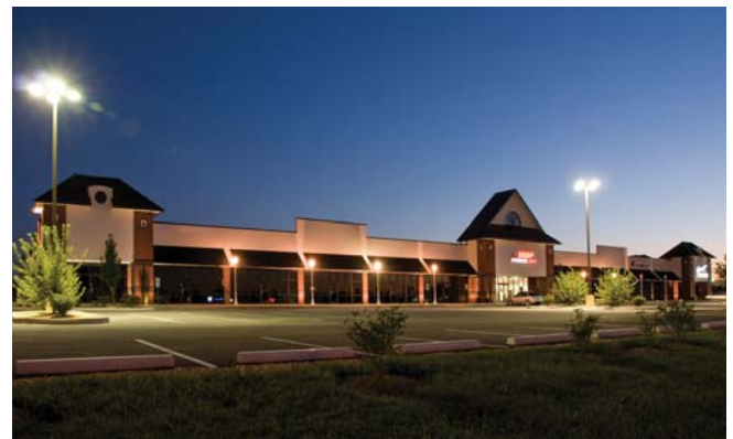
West Side Plaza Nixa, Missouri Morelock-Ross Builders, Builder