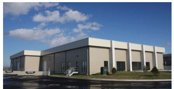
Kingsley Holdings Front Royal, Virginia Lantz Construction Company, Builder