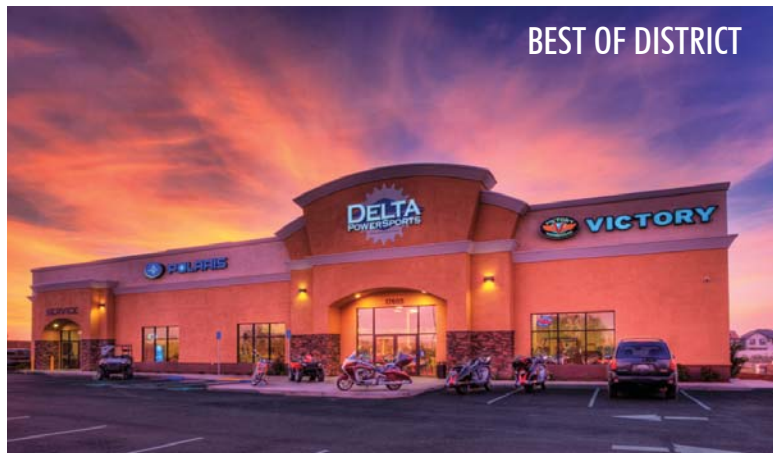
Project: Delta Power Sports Location: Lathrop, California Builder: TMW & Associates, Inc.