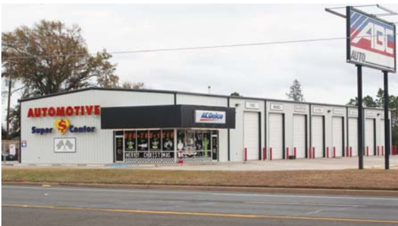
Automotive Super Center Longview, Texas LMH Construction, Builder