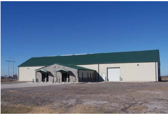
Owens Project Royse City, Texas Rafter P Construction, Inc., Builder