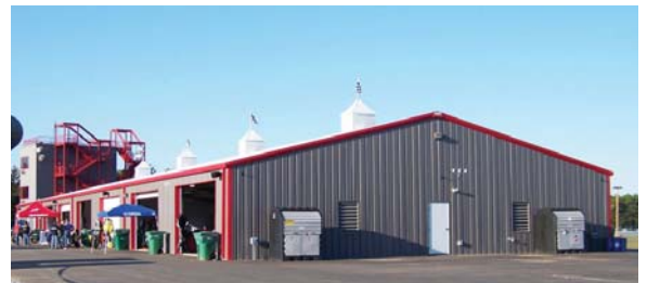
New Jersey Motorsports Park Philadelphia, Pennsylvania Archetto Construction, Inc., Builder