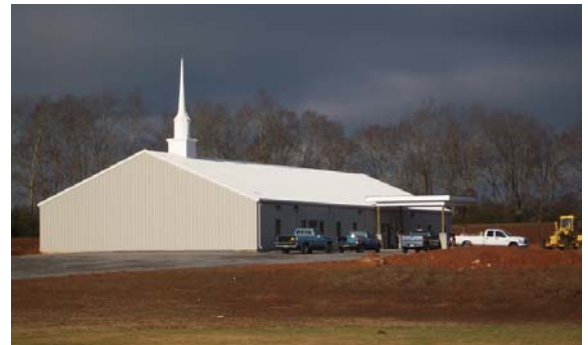
Victory Baptist Church Niota, Tennessee Wilson Construction Group, Builder