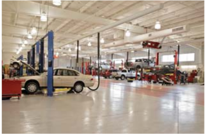
Project: Lia Toyota Location: Northampton, Massachusetts Builder: Forish Construction Co., Inc.