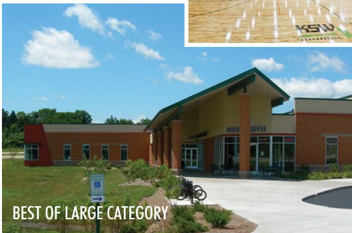
BEST OF LARGE CATEGORY

Project: Stoughton Wellness & Athletic Center Location: Stoughton, Wisconsin Builder: KSW Construction Corporation