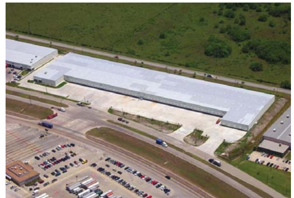
Barbours Cut Business Park 2 Morgan's Point, Texas Verde Const. /Mgmt International, Inc., Builder