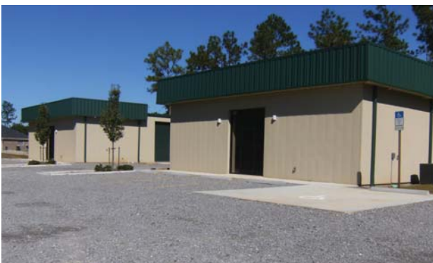
Ward Basin East Milton, Florida Cassida Construction Co., LLC, Builder