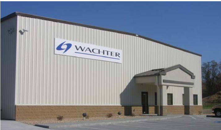
Wachter Electric St. Joseph, Missouri Al J. Mueller Construction Company, Builder