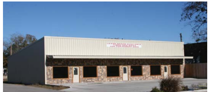
Sims-Hud Eagle Lake, Texas Eagle Lake Remodeling Plus, Builder