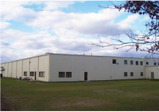
Governors America Corporation Agawam, Massachusetts Forish Construction Co., Inc., Builder