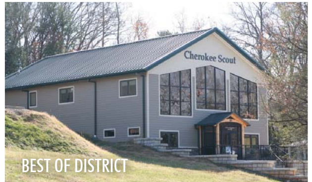
BEST OF DISTRICT

Project: Cherokee Scout Location: Murphy, North Carolina Builder: R. L. Wright Construction