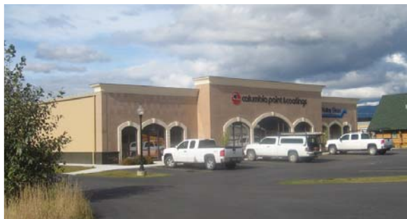
Sunrise Plaza North Columbia Falls, Montana Glenn's Construction, LLC, Builder