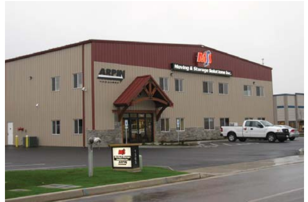
M & S Solutions Ferndale, Washington Faber Brothers Construction Corp., Builder