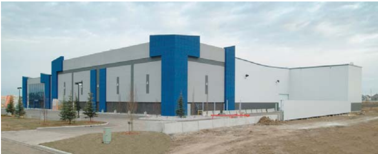
Consolidated Gypsum Edmonton, Alberta, Canada Cormode & Dickson Construction (1983), Ltd., Builder