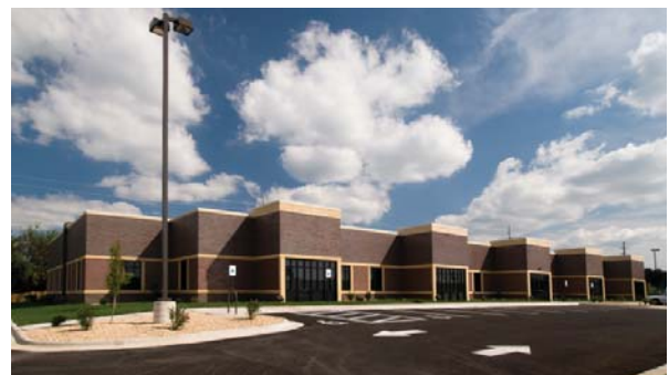
Peoples Bank Operations Center Springfield, Missouri Morelock-Ross Builders, Builder