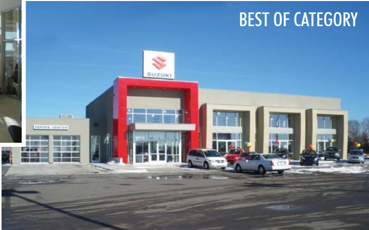
Project: Suzuki of Wichita Location: Wichita, Kansas Builder: Superior Structures, Inc.