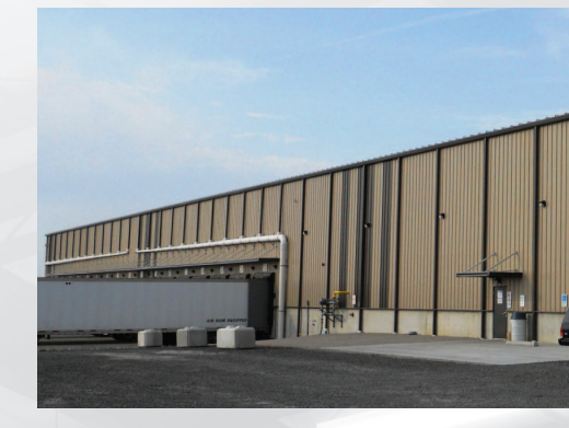
Glister Mary Lee Corp. - Distribution Center Perryville, Missouri Sargent Construction Company, Builder

Call Star Buildings at 1-800-879-7827 for the name and telephone number of a Star Builder near you. Or visit our website, www.starbuildings.com, to learn more about Star Building Systems.